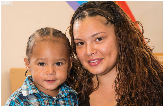
All photos featured are of actual FBMS shelter guests, housing participants, workforce development participants or graduates, or volunteers and donors.

Welcome to Your Estate Planning Guide and Organizer . You've just taken the hardest step in estate planning which is to sit down and get started. As an exercise instructor of an early morning class used to say, "You're here at 6:00 in the morning! The hardest part is done — the rest is easy!" And just as you can feel good when exercise class is over, you will also feel good once you have an estate plan in place. There are several benefits to making an estate plan: